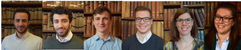
Minas Salib Sponsorship