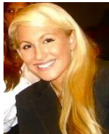
A. Kyjak-Lane Language