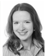
N. Pflugfelder Language